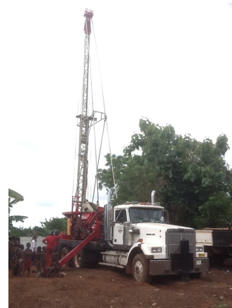
A GAIN water well drilling rig

To find out more about the Water for Life Initiative, go to p2c.sh/wfli . You can