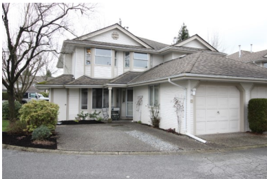
This home has served us well for the last 5 years!

owner", and although it was a fair bit of work and a big learning experience, we were blessed with God's peace through the process, and found a